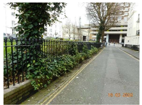
Ivy in Russell Square's overgrown south border, March 2020

Our volunteer gardening group has done some amazing work on Clarence Square and Russell Square over the last two years, which has made such a difference to those gardens. In fact one of the volunteer group's first priorities was to rescue the shady border in Russell Square from a carpet of ivy, and we've carried out similar work in Clarence Square.