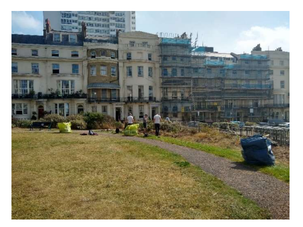
We filled a LOT of bags of weeds!

Over summer and autumn the RSAS volunteer gardening team began work on saving the plants we could save from the South border, and weeding and preparing the ground for the absolutely mammoth task of planting over 150 new plants into that border.