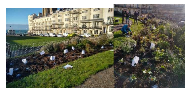
Everything planted according to the planting plan

On October 22<sup>nd</sup>, we began the big planting session. Group leader, Gill Wales, laid out where everything was to go and with military precision (and lots of cake!) the plants were unloaded from trucks straight into the ground in just one morning.