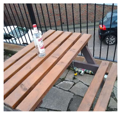
The morning after - not a good look for one of our Squares

We've had complaints about the picnic tables that appeared a few months ago on Regency Square. Members have highlighted that they have become a focus of anti-social behaviour, with street drinkers using them as a meeting place, leaving behind broken glass and rubbish after overnight drinking sessions.