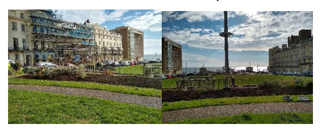
That is a lot of empty space to plant!