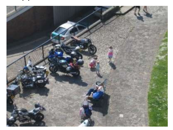
Hopefully a scene from the past ...?

Members have been unhappy with motorbikes parking on the South/bottom Regency Square garden for many years.