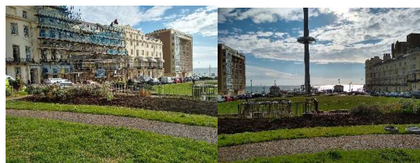
That is a lot of empty space to plant!