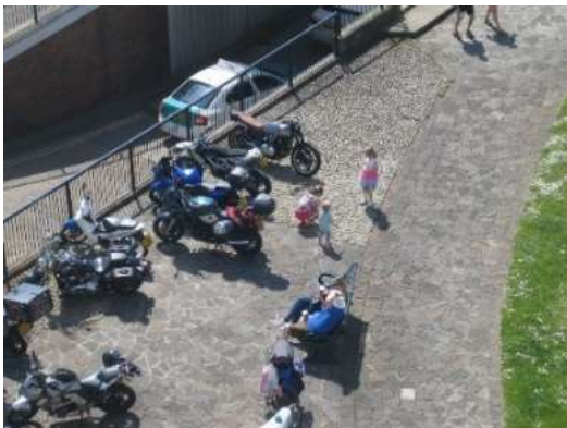
Hopefully a scene from the past...?

Members have been unhappy with motorbikes parking on the South/bottom Regency Square garden for many years.