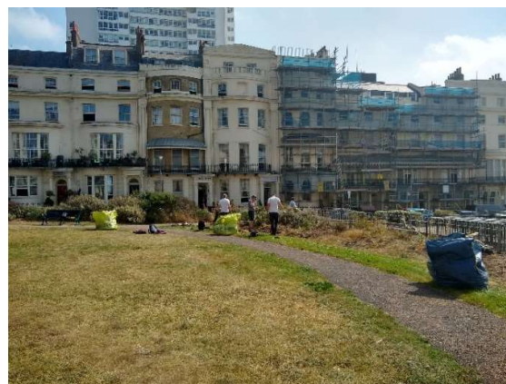
We filled a LOT of bags of weeds!

Over summer and autumn the RSAS volunteer gardening team began work on saving the plants we could save from the South border, and weeding and preparing the ground for the absolutely mammoth task of planting over 150 new plants into that border.