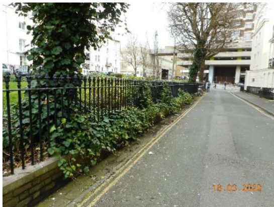
Ivy in Russell Square's overgrown south border, March 2020

Our volunteer gardening group has done some amazing work on Clarence Square and Russell Square over the last two years, which has made such a difference to those gardens. In fact one of the volunteer group's first priorities was to rescue the shady border in Russell Square from a carpet of ivy, and we've carried out similar work in Clarence Square.