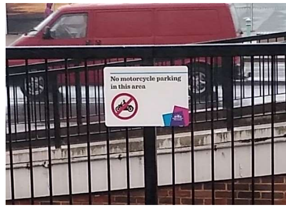
New signage all around the South/lower garden in Regency Square