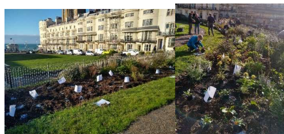
Everything planted according to the planting plan

On October 22 nd , we began the big planting session. Group leader, Gill Wales, laid out where everything was to go and with military precision (and lots of cake!) the plants were unloaded from trucks straight into the ground in just one morning.