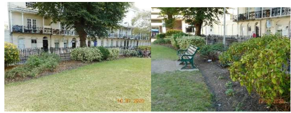
What a transformation! Russell Square, July 2020