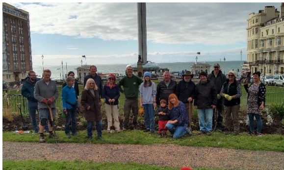
With thanks to the whole team!

So please, if you are a secret gardener, please don't be tempted to plant anything in this border. Every space has been carefully planned.