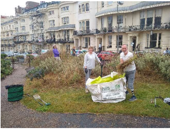
Everyone can find a way to contribute