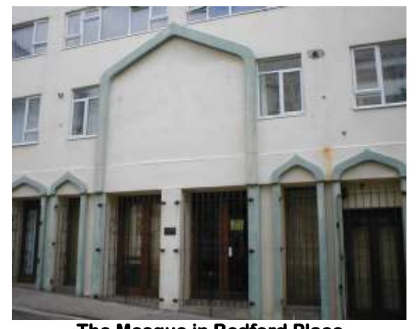
The Mosque in Bedford Place

in Regency Square. The rubbish won't go away just because there are no litter bins.