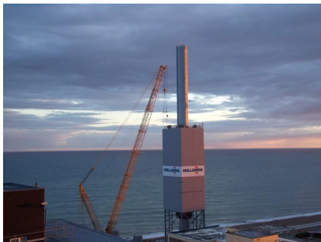
A reminder of the fabulous evening skies to be enjoyed from atop the i360.

Last month we had a view from the ever-growing i360. This month, the tables are turned and we are looking at the structure photographed in early July from a window in Sussex Heights.