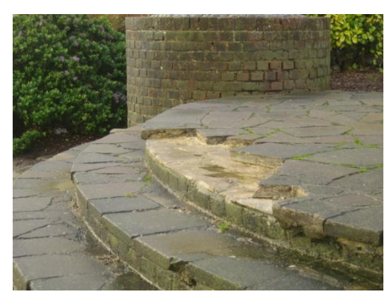
Broken\ step = broken\ ankle?

As you will have noticed, the gardens in Regency Square are in a sorry state.