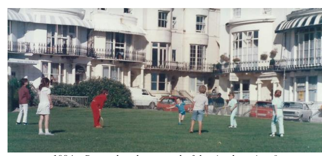
1984 – Remember those wonderful striped awnings?

To buy a copy of "Regency Sqaure, its history and its stories" for yourself or as a Christmas gift, at only £10.00 per copy to members contact Suzanne Hinton (details in the box above).