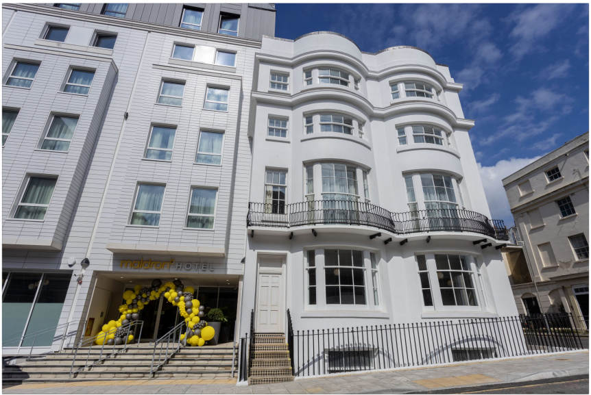
The Maldron Hotel in Cannon Place.