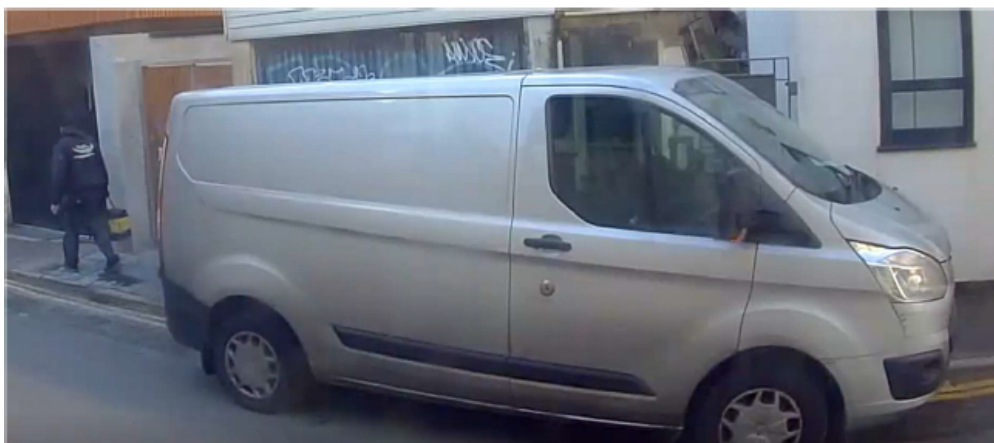
Vans block the pavement and park on double yellow lines