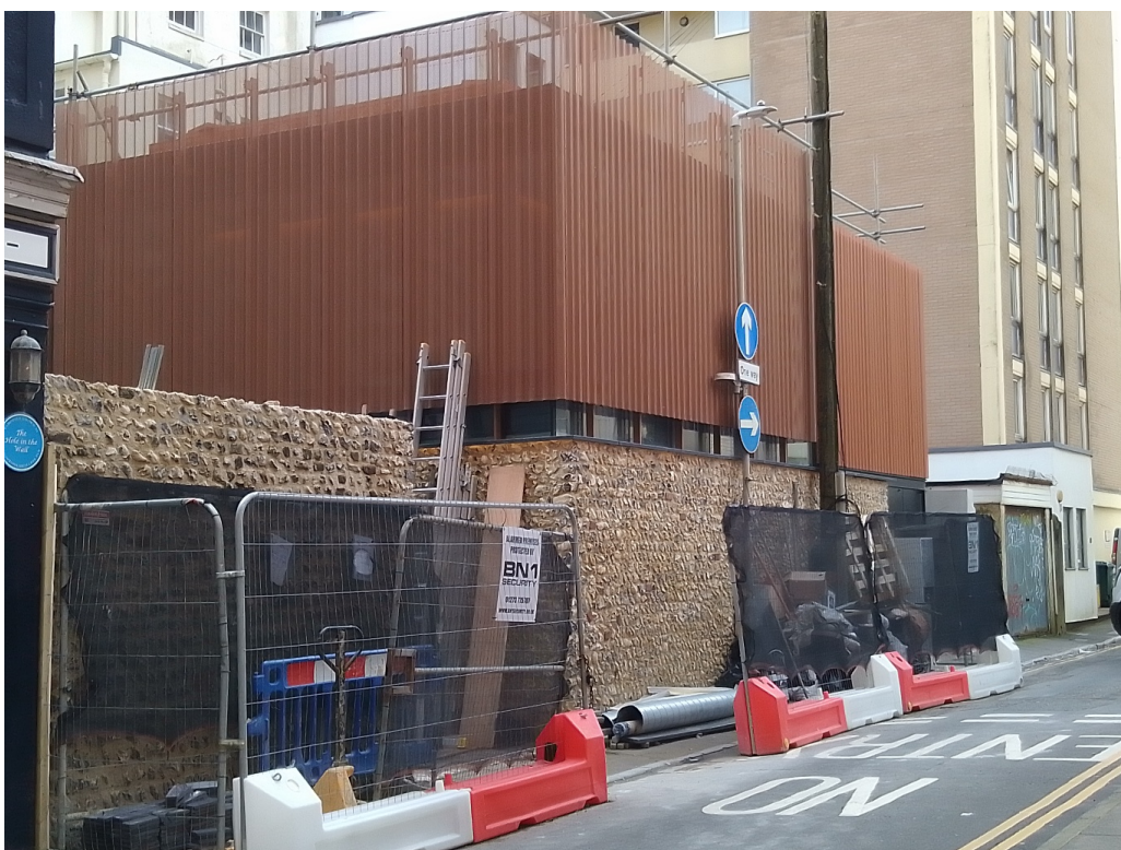
"The monolith" as predicted by CAG – and builders rubbish that has lingered for nearly two years.