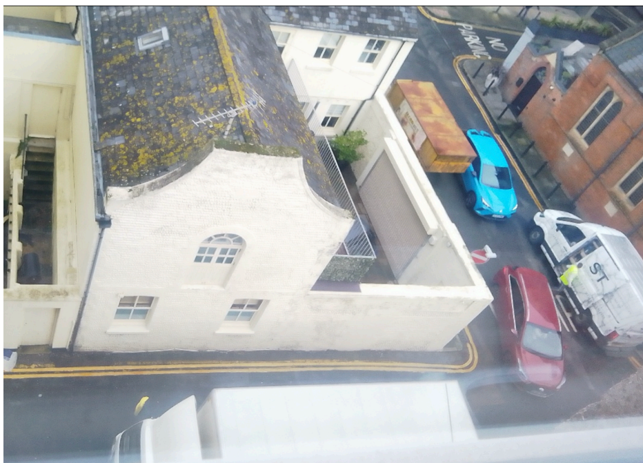
Vans blocking Queensbury Mews and private cars left waiting

What is planning for if it is not to protect the residents of Brighton and Hove from noise, disruption and deterioration of their environment? Our local council, in its eagerness to get more business rates and to improve the look of the promenade, has sacrificed the peace and well-being of its own residents.