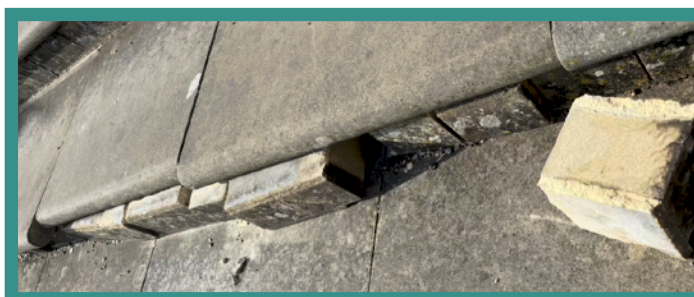
Reported July 15th

B&HC worked quickly to organise the repair. Within two weeks the damage was repaired along with other smaller jobs. Great work and a big thank you to all involved.