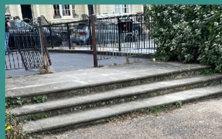
Repaired July 29th