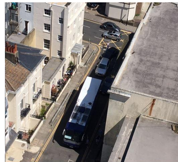
Large vehicle accessing Metropole Exhibition Halls June 2017

Today, vehicles are bigger. For that reason and (possibly) for health and safety reasons, very few delivery vehicles enter the loading bay. They tend to park and unload in the street. Loading bays have been moved and general chaos has ensued to the disadvantage of local residents.