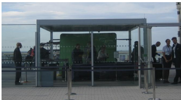
West Pier - now you see it, now you don't

The Society is also concerned that the green screen at the back of the shelter obscures an iconic view of the West Pier. This screen does not even blend in with the sponsor's, British Airways, colour scheme.